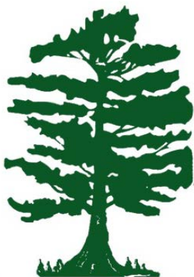
Lamar State College-Orange